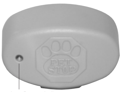
Low Battery Indicator