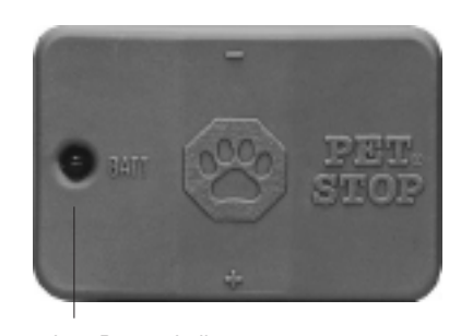
Low Battery Indicator

Remove this cover using a flat-ended screwdriver or coin to replace the battery.